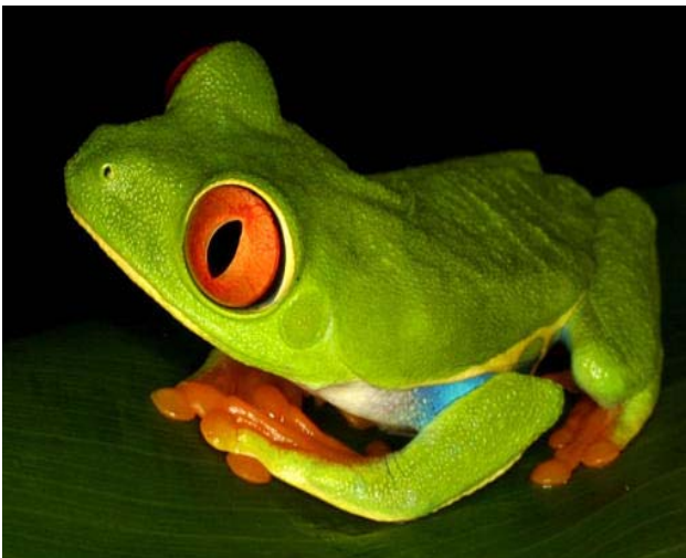
Multicolored Costa Rican Tree Frog

study of the human and physical geography of the beautiful and biologically diverse country of Costa Rica in Central America. Topics to be covered include cultural geography, economic development, physical geography (vegetation, animals and topography) and environmental conservation (ecotourism and deforestation). No prior coursework needed. Permission of instructors required.