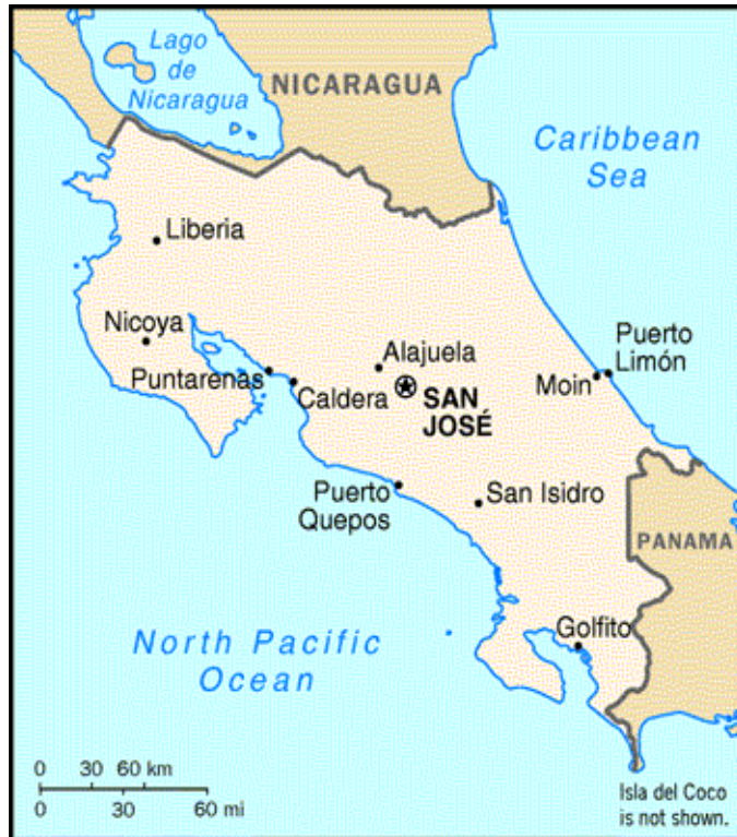
Map of Coast Rica and Surrounding Countries