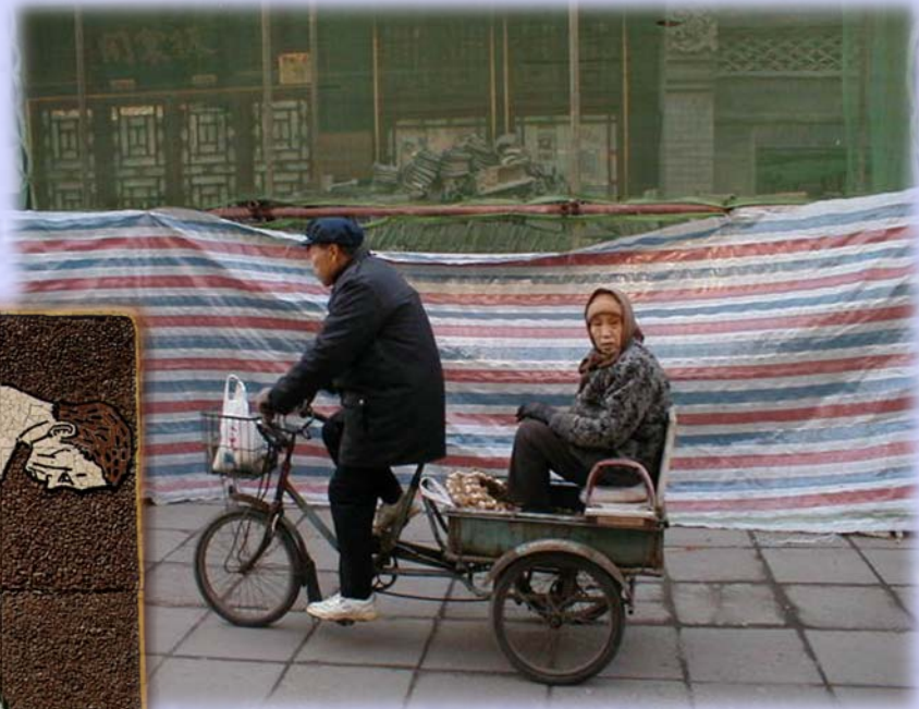
Off to Market. – “Potatoes and onions for sale”, China