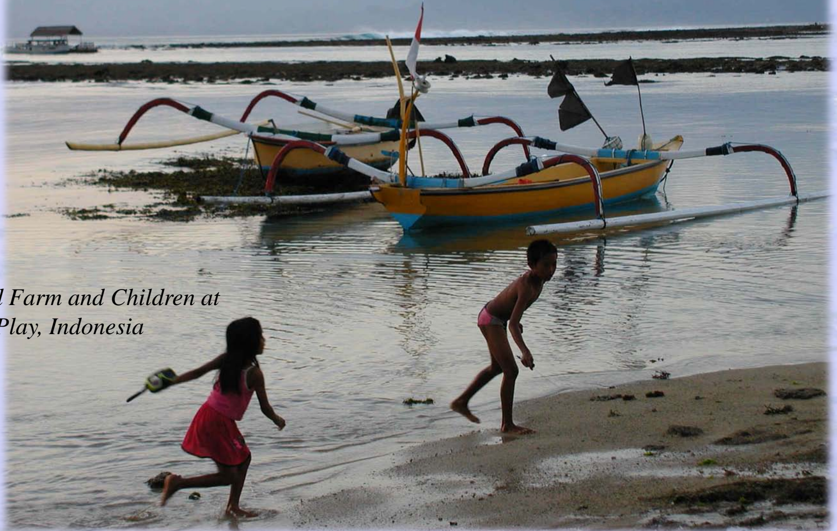
Seaweed Farm and Children at Play, Indonesia