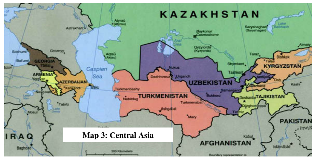
Map 3: Central Asia