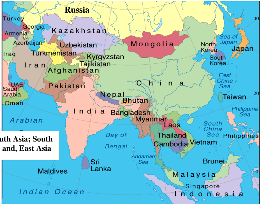
Map 1: South Asia; South East Asia; and, East Asia