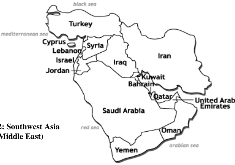
Map 2: Southwest Asia (Middle East)